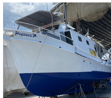
Pegasus and dories