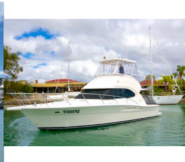
Silver Lining II