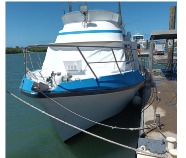
Listing no: 370