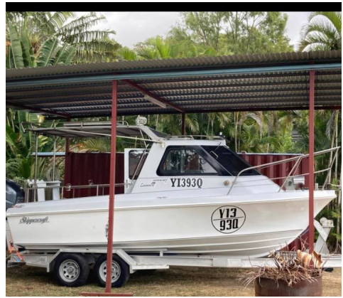
Listing No: 8483