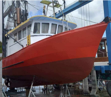
Listing No 8341