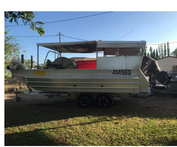
Listing No: 8371