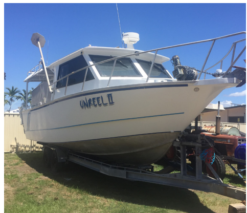
Unreel II (Currently fishing)