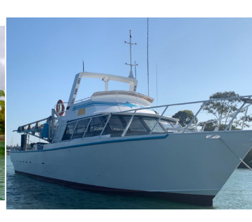
Listing No 8362